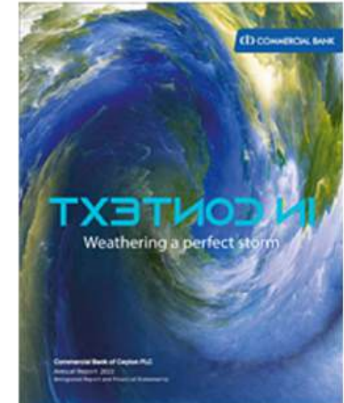
Commercial Bank of Ceylon PLC