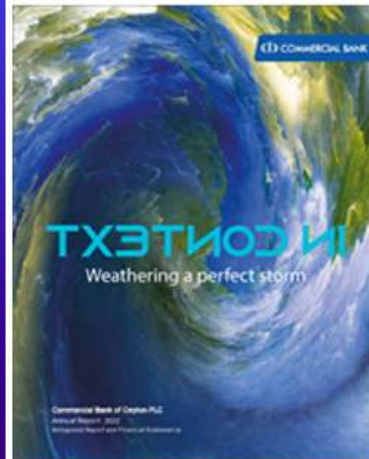
Commercial Bank of Ceylon PLC