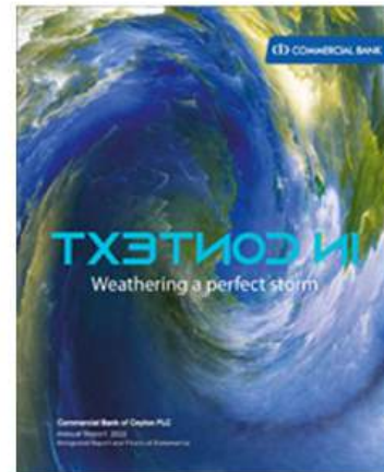
Commercial Bank of Ceylon PLC