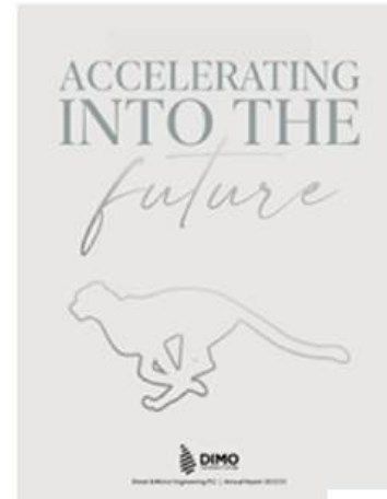
Diesel & Motor Engineering PLC