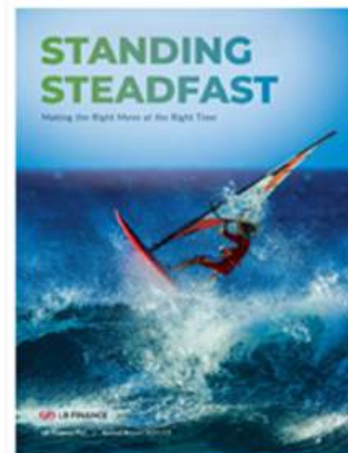
LB Finance PLC