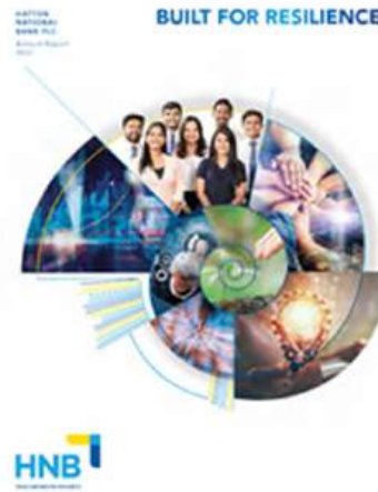
Hatton National Bank PLC