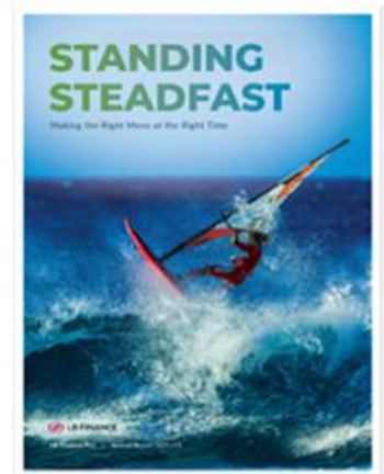
LB Finance PLC