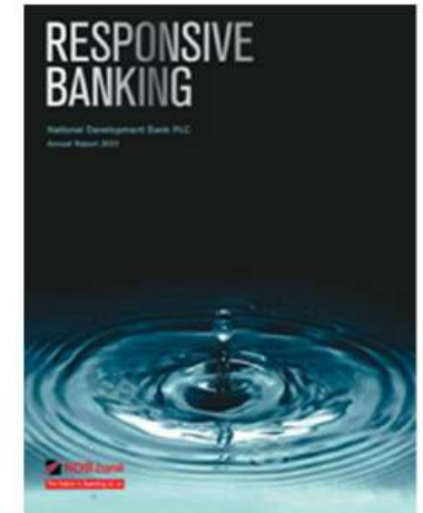
National Development Bank PLC