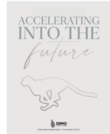
Diesel & Motor Engineering PLC