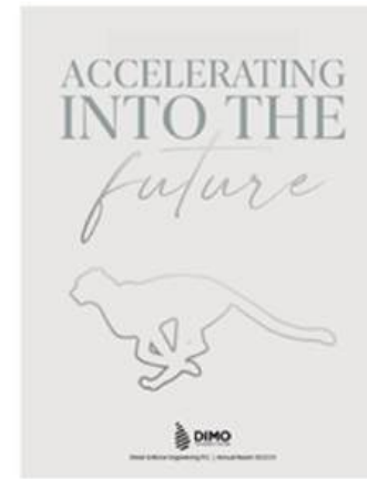
Diesel & Motor Engineering PLC